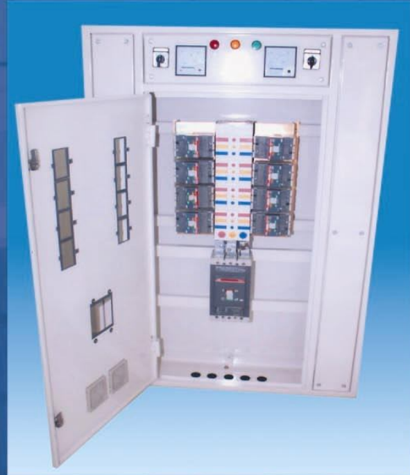
Inside view of HEC PB