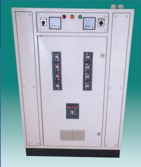
Front view of HEC PB